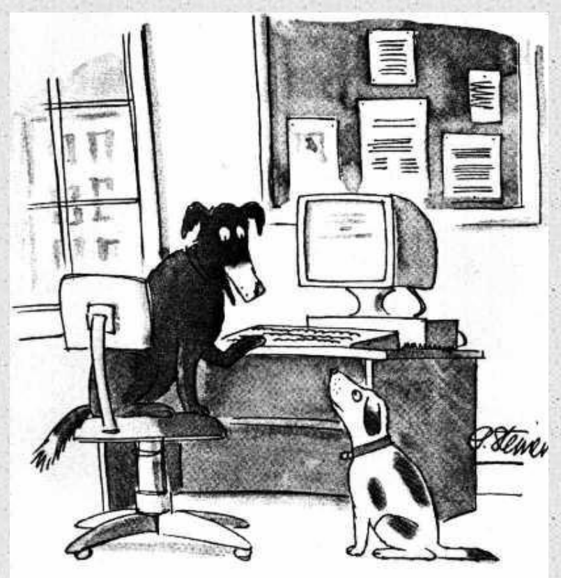
"On the Internet, nobody knows you're a dog."